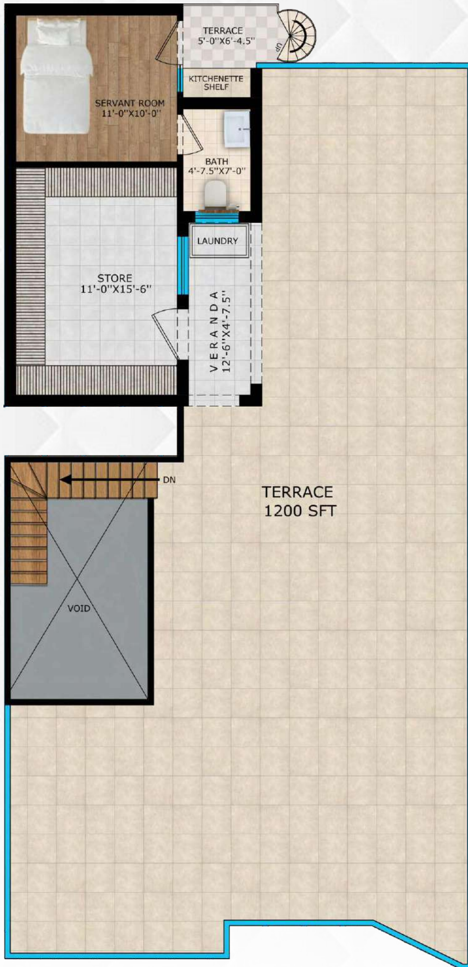
TOP FLOOR 450 SFT