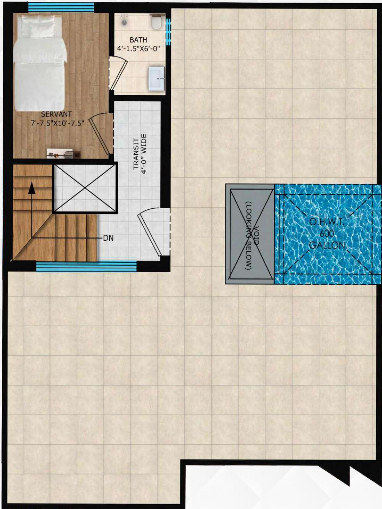
TOP FLOOR 259 SFT