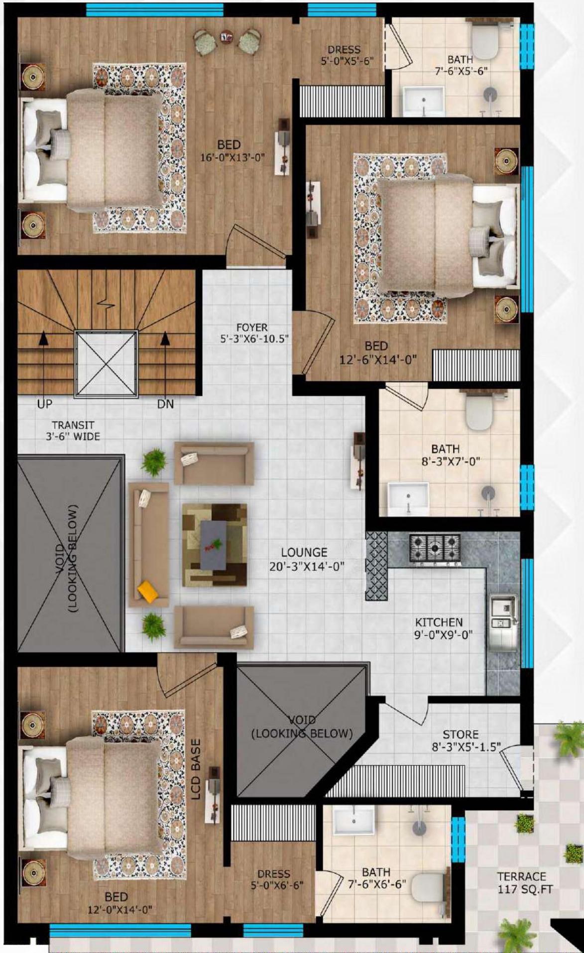
FIRST FLOOR 1523 SFT